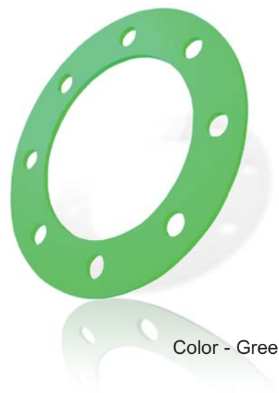
Color - Green